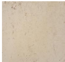
CW103 Mineral White Concrete