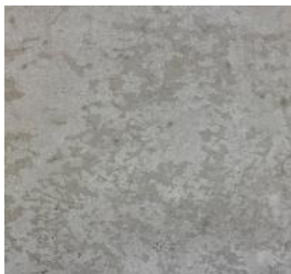
CW101 Natural Grey Concrete